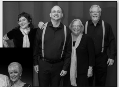
WHAT'S THE DEAL